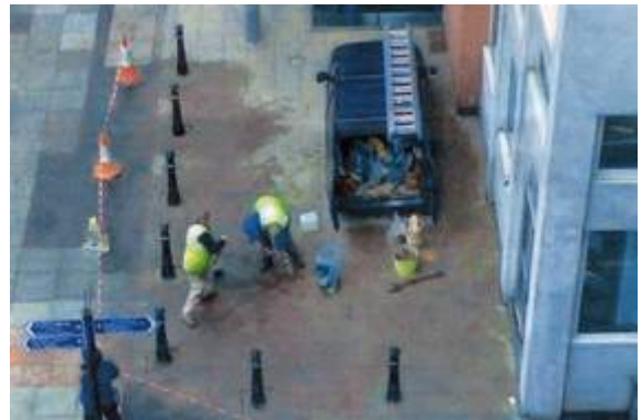
These men have just finished installing the bollards and are clearing up prior to driving away...er...